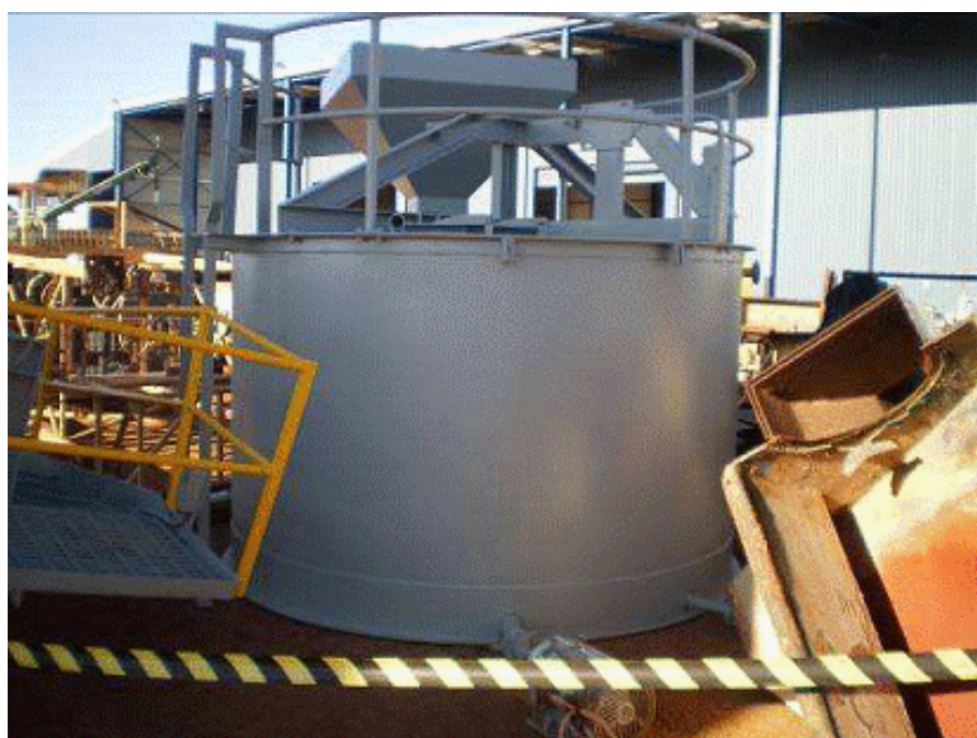
Mixing Tank with band and Surface Treatment