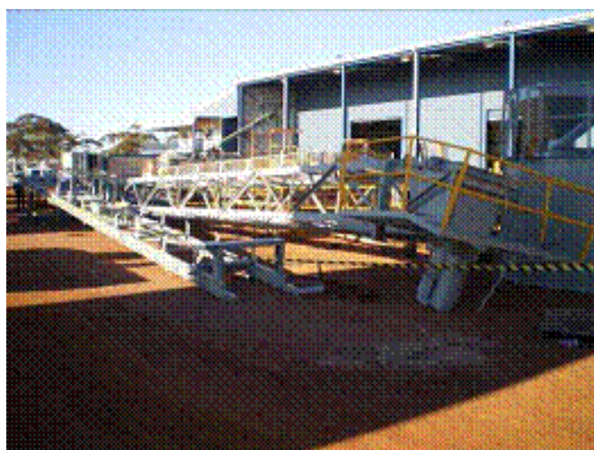
Conveyors during Refurbishment