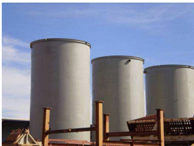
Tanks before and after surface treatment