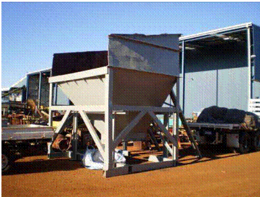
Mill Feed Bin after Surface Treatment